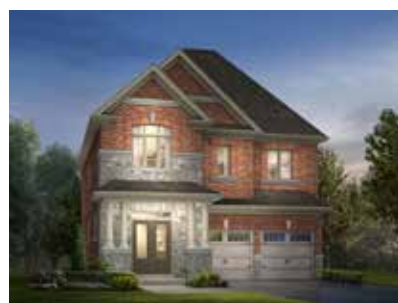
Elevation C | 2,520 sq.ft.

Visit aspenridgehomes.com Please see sales representative for Elevation B & C.