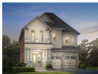
Elevation B | 2,516 sq.ft.