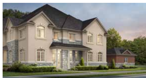
Elevation B | 2,179 SQ.FT.