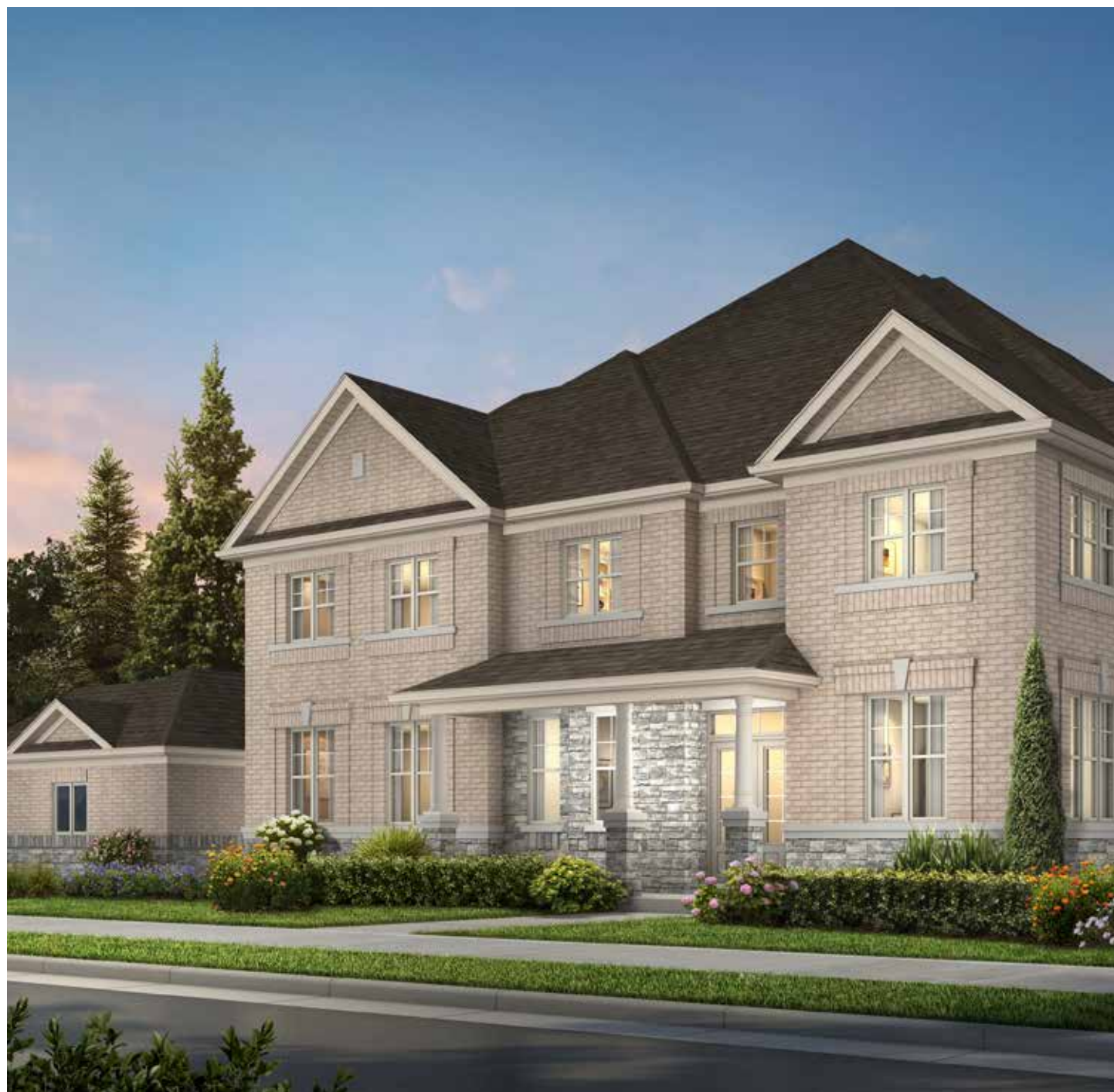
Elevation A | 2,188 SQ.FT.