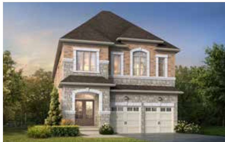
Elevation B | 2932 sq. ft.