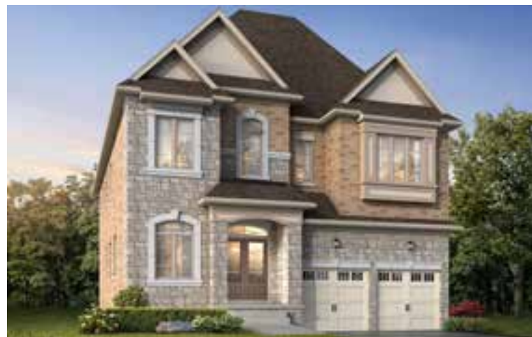
Elevation B | 3755 sq. ft.