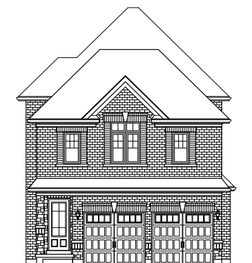
Rear Lane Elevation A