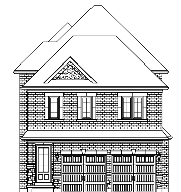
Rear Lane Elevation B