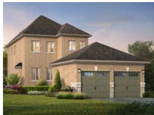
Rear Lane Elevation A