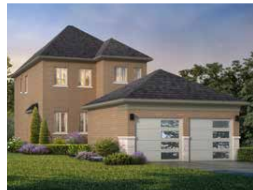
Rear Lane Elevation C