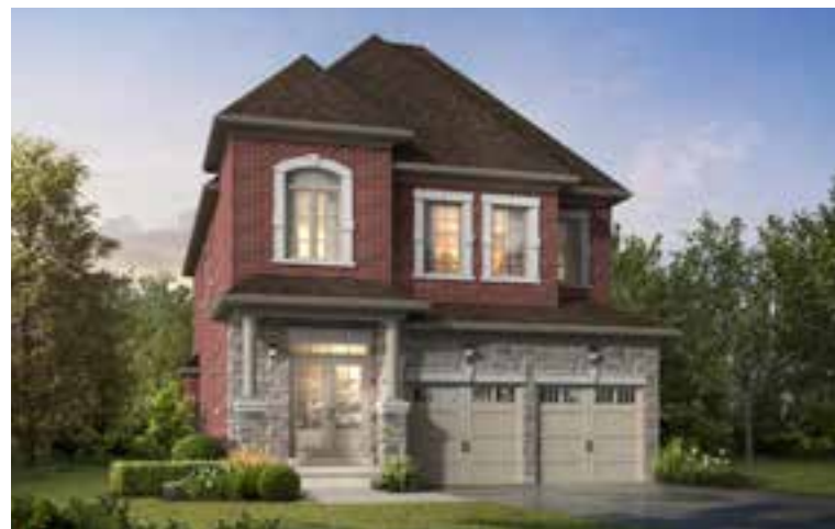
Elevation B | 2635 sq. ft.